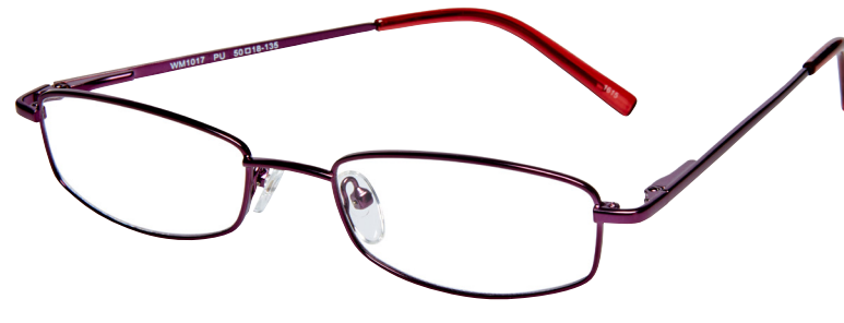
SKU: 1202040 Style: WM1017 PRP Color: Purple Category: Adult Material: Metal Size: 50 18 135