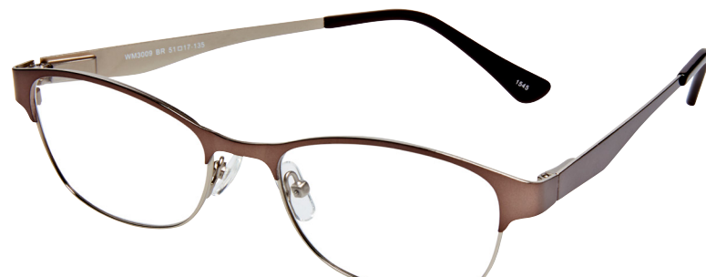
SKU: 1265918 Style: WM3009 BRN Color: Brown Category: Adult Material: Metal Size: 51 17 135