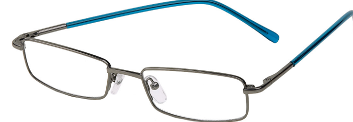
SKU: 10308423 Style: L8021 Color: Gunmetal