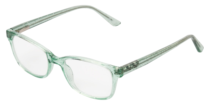
SKU: 10309691 Style: L8057 GRN Color: Green Category: Kids Material: Plastic Size: 46 16 130