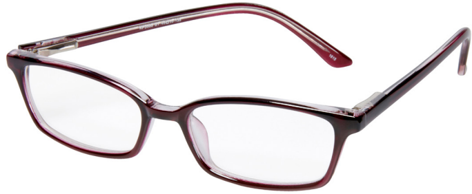
SKU: 1264107 Style: KP3000 BRY Color: Berry