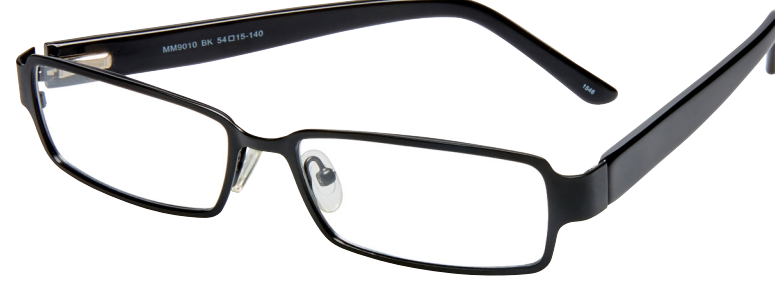
SKU: 1163001 Style: MM9010 BLK Color: Black Category: Adult Material: Metal Size: 54 15 140