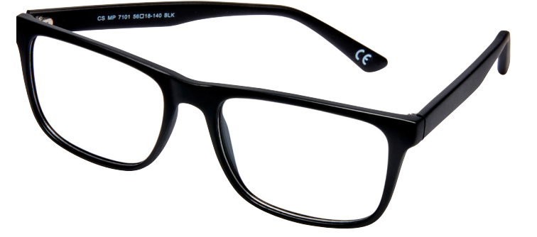
SKU: 1331259 Style: MP7101 BLK Color: Black Category: Adult Material: Plastic Size: 56 18 140