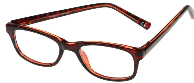
SKU: 10302576 Style: L8029 TORTOISE Color: Tortoise