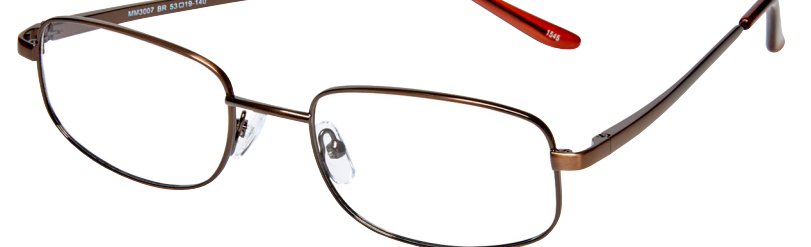
SKU: 1265623 Style: MM3007 BRN Color: Brown Category: Adult Material: Metal Size: 53 19 140