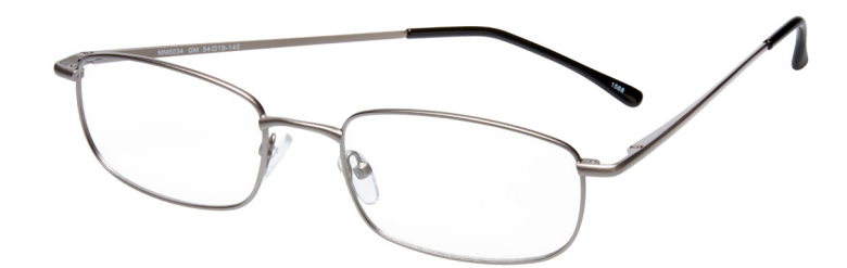
SKU: 1260913 Style: MM5034 GUN Color: Gunmetal Category: Adult Material: Metal Size: 54 19 145