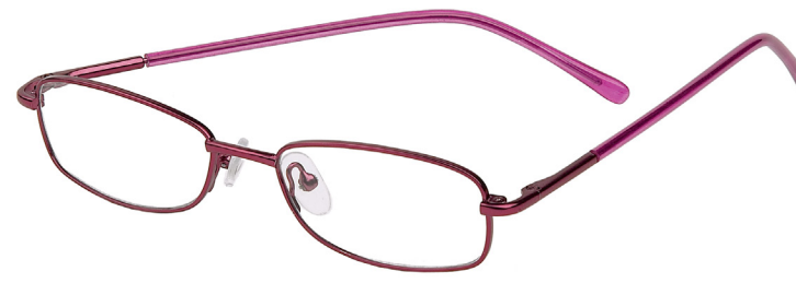
SKU: 10308425 Style: L8023 Color: Pink Category: Kids Material: Metal Size: 48 16 135