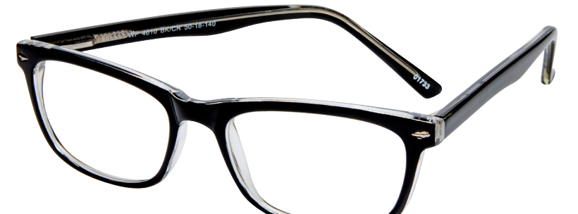
SKU: 1277255 Style: WP4010 BLK Color: Black Category: Adult Material: Plastic Size: 50 17 140