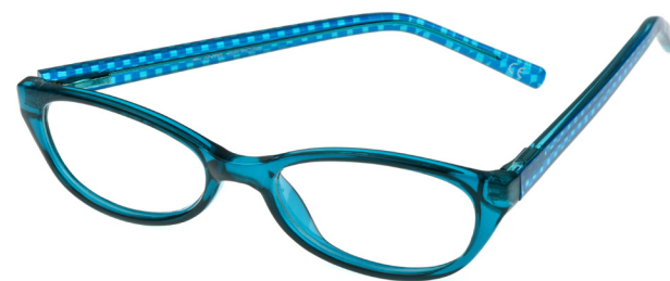
SKU: 10308422 Style: L8028 TEL Color: Teal Category: Kids Material: Plastic Size: 48 17 130