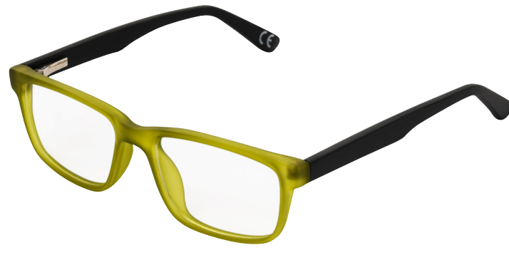
SKU: 10309689 Style: L8050 GRN Color: Green Category: Kids Material: Plastic Size: 47 15 130