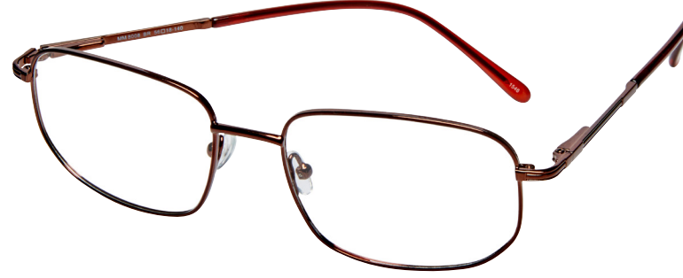
SKU: 1148029 Style: MM8008 BRN Color: Brown Category: Adult Material: Metal Size: 56 18 140