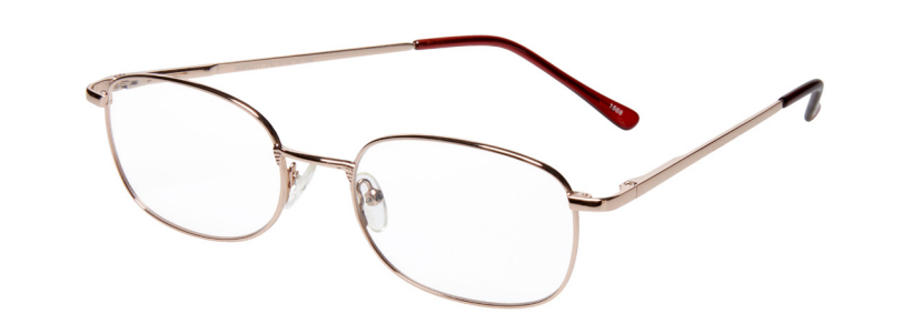
SKU: 1260904 Style: MM5017 GLD Color: Gold Category: Adult Material: Metal Size: 51 18 140