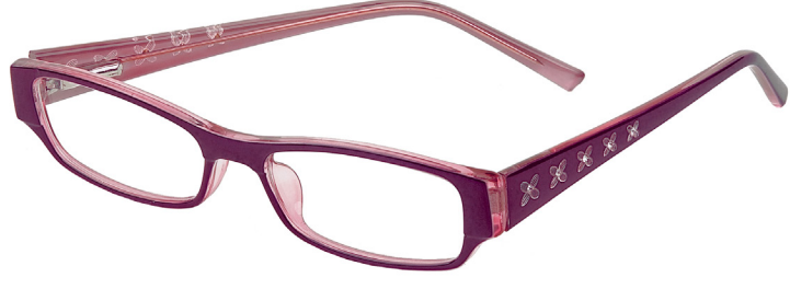
SKU: 10302597 Style: L8014 PRP Color: Purple Category: Kids Material: Plastic Size: 48 16 130