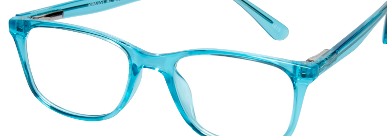
SKU: 1312387 Style: KP6101 BLU Color: Blue