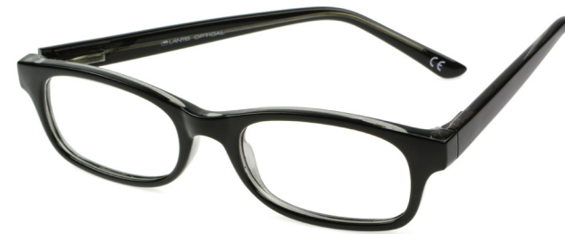
SKU: 10308419 Style: L8018 BLK Color: Black Category: Kids Material: Plastic Size: 45 16 135