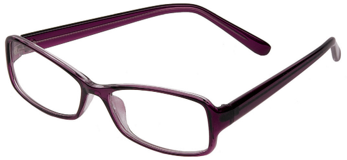
SKU: 10300669 Style: L6003 PRP Color: Purple Category: Adult Material: Plastic Size: 54 16 135