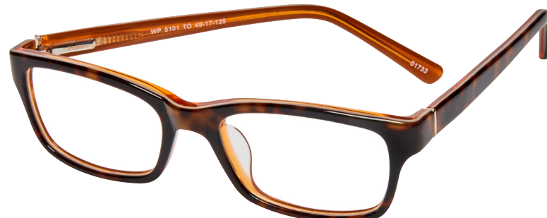
SKU: 1293656 Style: WP5101 TOR Color: Tortoise Category: Adult Material: Plastic Size: 49 17 135