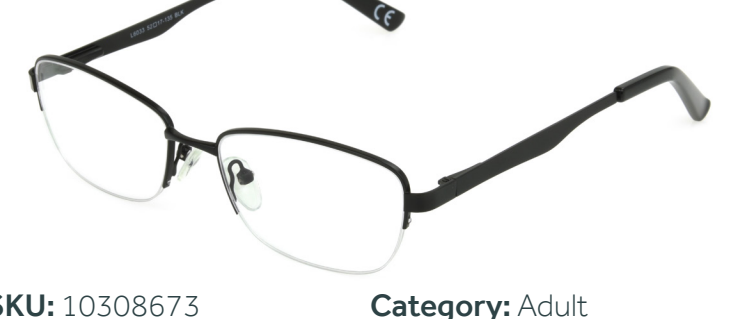
SKU: 10308673 Style: L6033 BLK Color: Black Category: Adult Material: Metal Size: 52 17 135