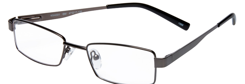
SKU: 1275550 Style: KM4001 GUN Color: Gunmetal