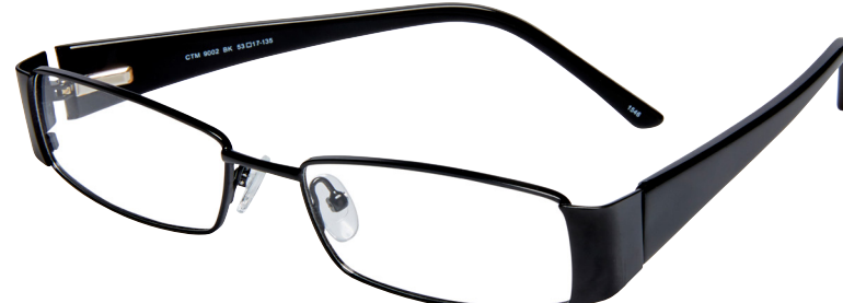
SKU: 1154100 Style: CTM 9002 BLK Color: Black Category: Adult Material: Metal Size: 53 17 135