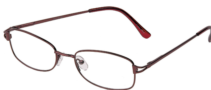
SKU: 10300630 Style: L6006 WIN Color: Wine Category: Adult Material: Metal Size: 52 18 135