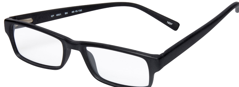
SKU: 1275658 Style: KP4001 BLK Color: Black