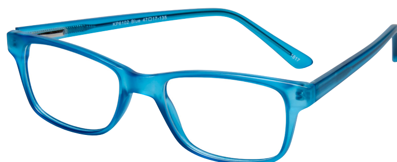
SKU: 1312430 Style: KP6102 BLU Color: Blue