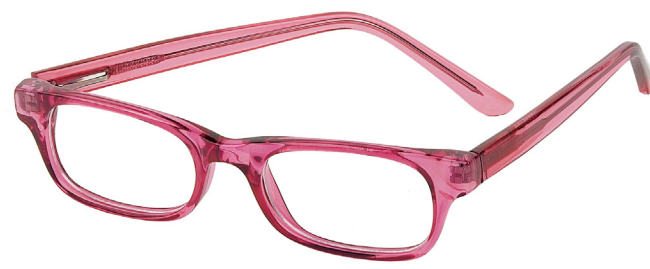
SKU: 10308418 Style: L8018 Color: Pink Category: Kids Material: Plastic Size: 42 16 128