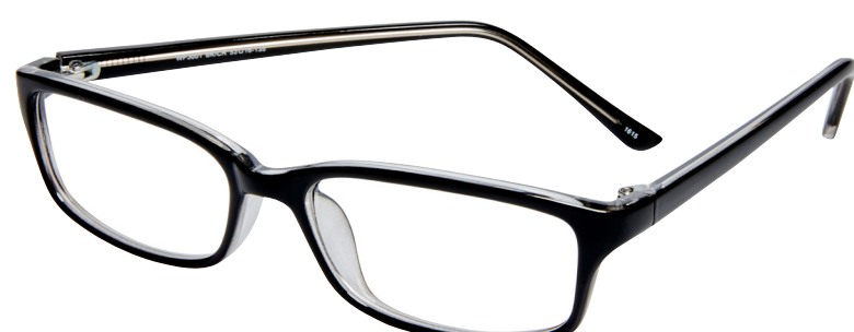
SKU: 1264928 Style: WP3001 BLK Color: Black Category: Adult Material: Plastic Size: 53 16 135