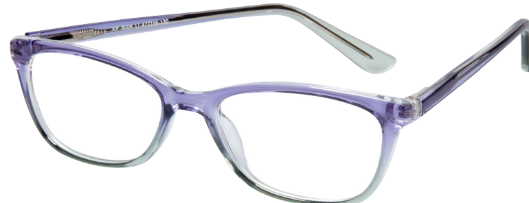
SKU: 1340775 Style: KP8006 LIL Color: Lilac