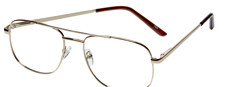
SKU: 1293237 Style: MM5106 GLD Color: Gold Category: Adult Material: Metal Size: 56 17 150