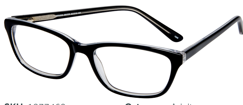
SKU: 1277460 Style: WP4002 BLK Color: Black Category: Adult Material: Plastic Size: 52 16 135