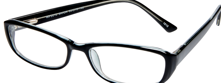
SKU: 1238565 Style: WP2010 BLK Color: Black Category: Adult Material: Plastic Size: 53 16 140