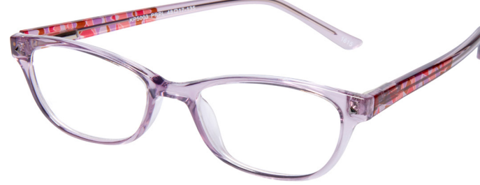
SKU: 1291934 Style: KP5003 PRP Color: Purple