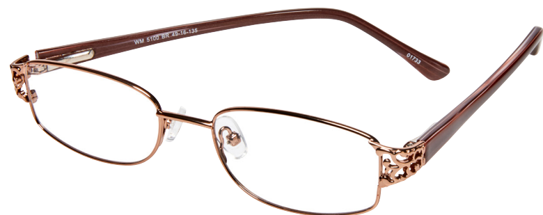
SKU: 1293629 Style: WM5100 BRN Color: Brown Category: Adult Material: Metal Size: 49 16 135