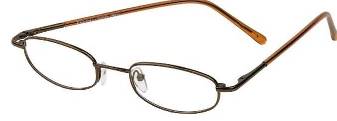
SKU: 10308040 Style: L8009 Color: Brown