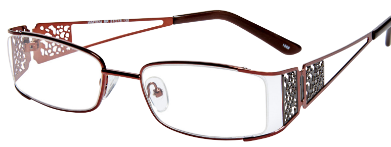
SKU: 1260986 Style: WM1024 BRN Color: Brown Category: Adult Material: Metal Size: 51 18 135