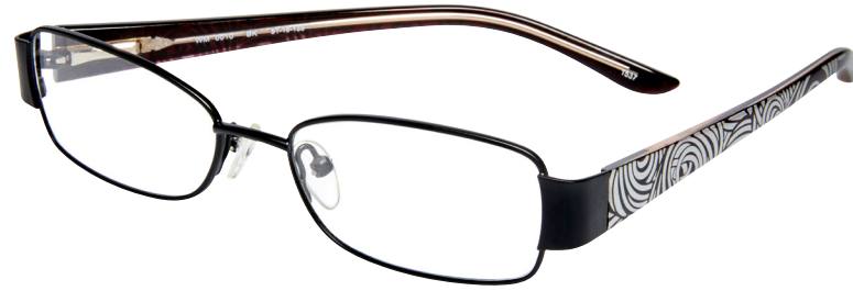
SKU: 1192266 Style: WM0010 Color: Black Category: Adult Material: Metal Size: 51 16 135