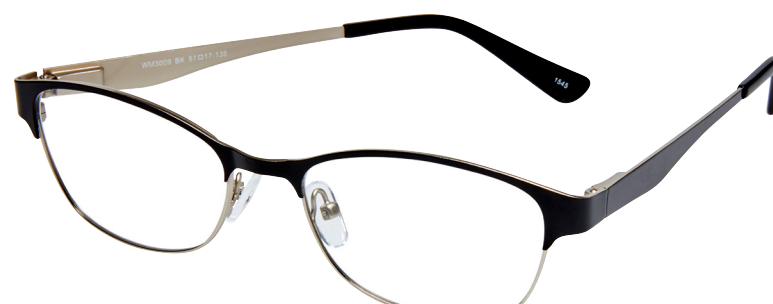
SKU: 1265927 Style: WM3009 BLK Color: Black Category: Adult Material: Metal Size: 51 17 135