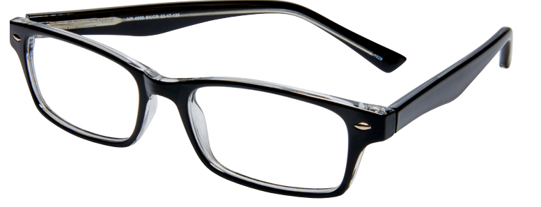
SKU: 1278290 Style: MP4005 BLK Color: Black Category: Adult Material: Plastic Size: 52 17 135