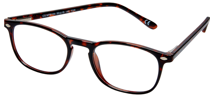
SKU: 1312859 Style: MP6104 TOR Color: Tortoise Category: Adult Material: Plastic Size: 50 19 140