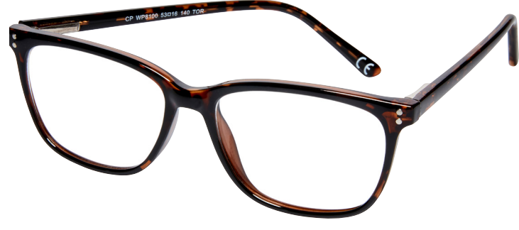
SKU: 1338680 Style: WP8100 TOR Color: Tortoise Category: Adult Material: Plastic Size: 53 16 140