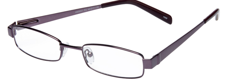
SKU: 1263233 Style: KM3001 PRP Color: Purple