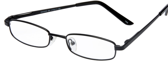
SKU: 1263180 Style: KM 3003 Color: Black