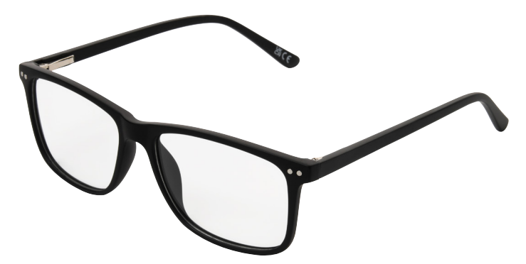
SKU: 10309688 Style: L7087 BLK Color: Black Category: Kids Material: Plastic Size: 56 16 145