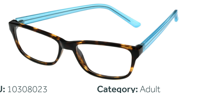
SKU: 10308023 Style: L6016 TOR Color: Tortoise Category: Adult Material: Plastic Size: 53 17 135