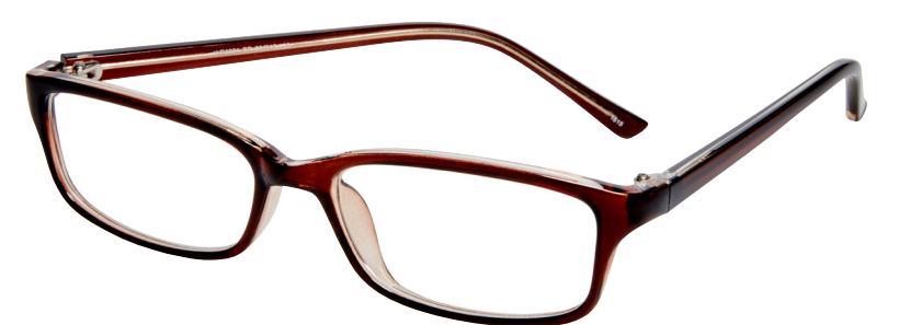
SKU: 1264919 Style: WP3001 BRN Color: Brown Category: Adult Material: Plastic Size: 53 16 135