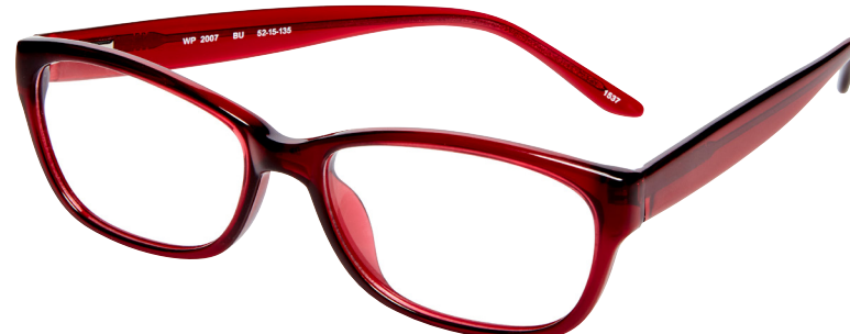
SKU: 1224945 Style: WP2007 BUR Color: Red Category: Adult Material: Plastic Size: 52 15 135