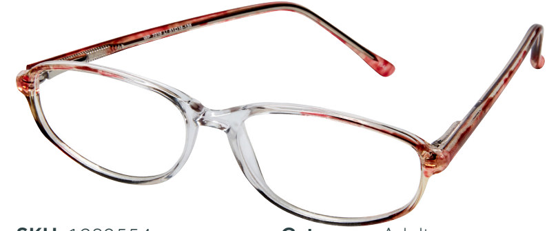
SKU: 1289554 Style: WP7016 LIL Color: Lilac Category: Adult Material: Plastic Size: 51 14 135