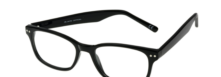
SKU: 10302562 Style: L7015 BLK Color: Black Category: Adult Material: Plastic Size: 52 18 140