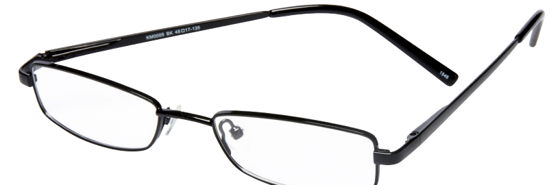
SKU: 1169096 Style: KM 0005 BLK Color: Black Category: Kids Material: Metal Size: 48 17 135