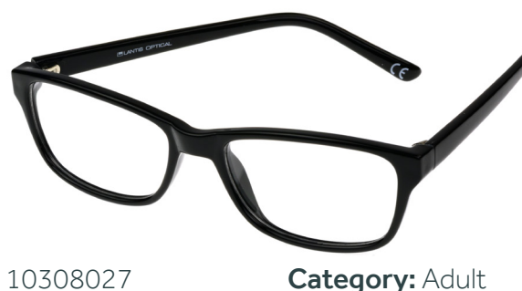
SKU: 10308027 Style: L6016 BLK Color: Black Category: Adult Material: Plastic Size: 53 17 135