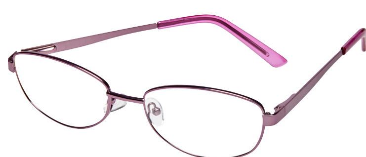
SKU: 1312706 Style: WM6102 PRP Color: Purple Category: Adult Material: Metal Size: 53 17 140