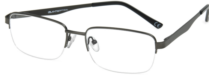
SKU: 10308675 Style: L7070 GUN Color: Gunmetal Category: Adult Material: Metal Size: 54 17 140