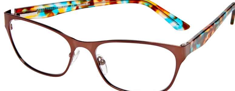
SKU: 1293479 Style: WM5104 BRN Color: Brown Category: Adult Material: Metal Size: 52 16 140