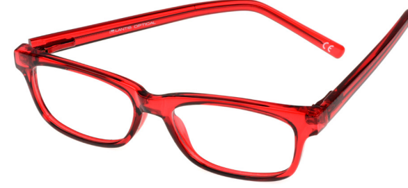
SKU: 10303007 Style: L8027 RED Color: Red Category: Kids Material: Plastic Size: 46 15 130