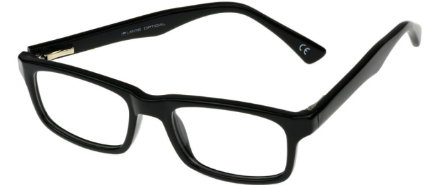
SKU: 10308025 Style: L8030 BLACK Color: Black