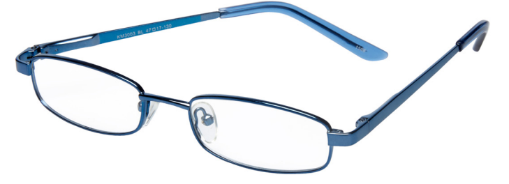
SKU: 1263199 Style: KM3003 BLU Color: Blue