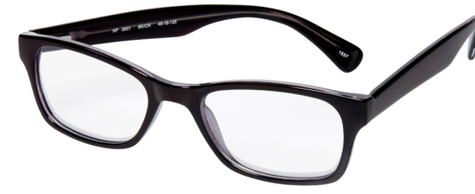
SKU: 1264170 Style: KP3001 BLK Color: Black