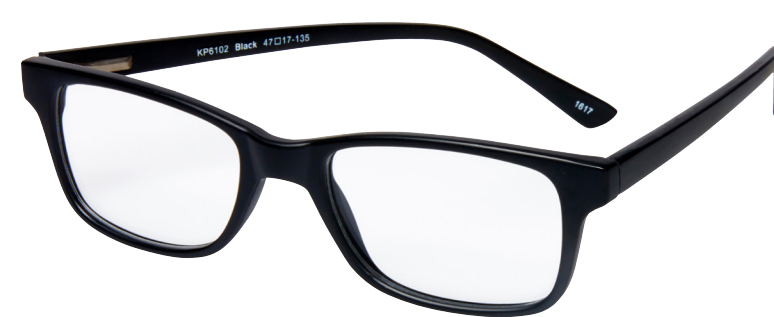
SKU: 1312449 Style: KP6102 BLK Color: Black