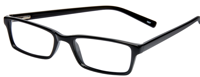
SKU: 1214288 Style: MP1009 BLK Color: Black Category: Adult Material: Plastic Size: 51 17 140