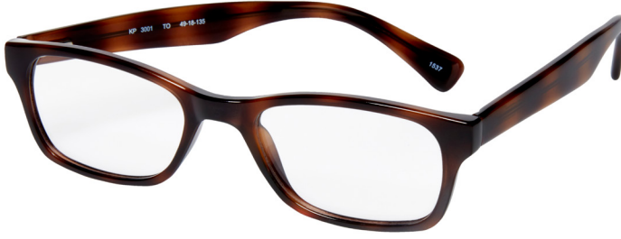
SKU: 1264198 Style: KP3001 TOR Color: Tortoise