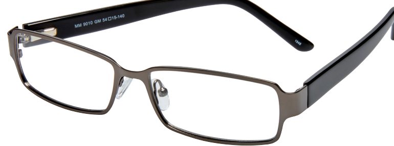
SKU: 1163010 Style: MM9010 GUN Color: Gunmetal Category: Adult Material: Metal Size: 54 15 140