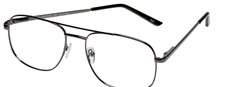
SKU: 1293246 Style: MM5106 GUN Color: Gunmetal Category: Adult Material: Metal Size: 56 17 150