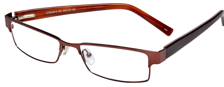
SKU: 1163760 Style: CTM 9010 BRN Color: Brown Category: Adult Material: Metal Size: 55 16 140