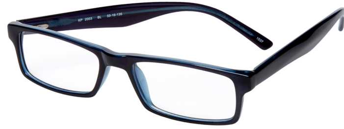
SKU: 1232552 Style: KP2003 BLU Color: Blue