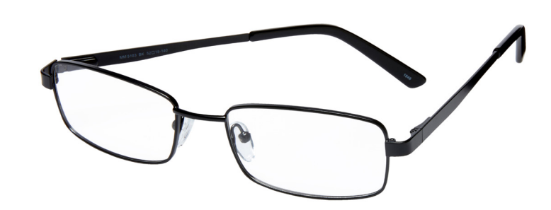
SKU: 1293175 Style: MM5103 BLK Color: Black Category: Adult Material: Metal Size: 52 18 140