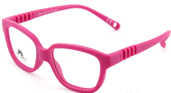
SKU: 10308679 Style: L8049 BRY Color: Berry Category: Kids Material: Plastic Size: 43 14 115