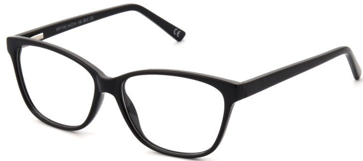
SKU: 1331179 Style: WP7106 BLK Color: Black Category: Adult Material: Plastic Size: 54 14 140