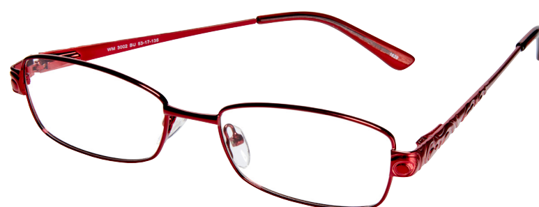
SKU: 1264385 Style: WM3002 BRG Color: Red Category: Adult Material: Metal Size: 53 17 135