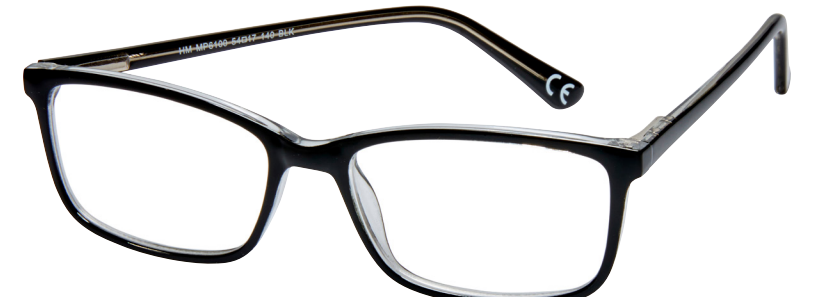
SKU: 1312225 Style: MP6100 BLK Color: Black Category: Adult Material: Plastic Size: 54 17 140