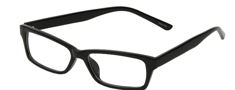
SKU: 10302593 Style: L7007 BLK Color: Black Category: Adult Material: Plastic Size: 55 17 145