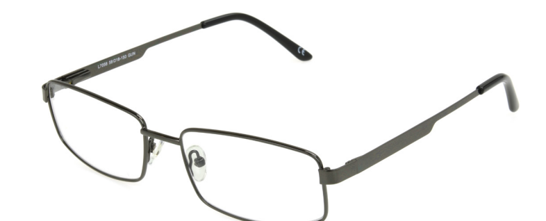
SKU: 10308672 Style: L7056 GUN Color: Gunmetal Category: Adult Material: Metal Size: 58 18 150