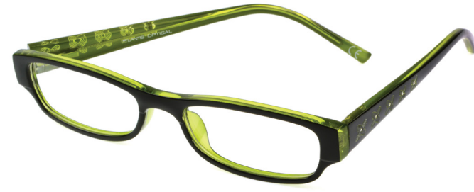
SKU: 10302598 Style: L8014 BGR Color: Green Category: Kids Material: Plastic Size: 48 16 130