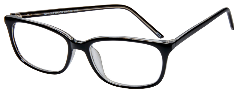
SKU: 1278156 Style: MP4003 BLK Color: Black Category: Adult Material: Plastic Size: 54 16 140