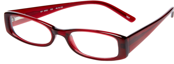
SKU: 1232534 Style: KP2002 PRP Color: Purple