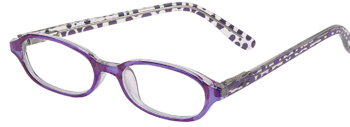
SKU: 10308031 Style: L8015 Color: Purple Category: Kids Material: Plastic Size: 45 16 126