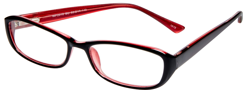
SKU: 1238556 Style: WP2010 BRG Color: Red Category: Adult Material: Plastic Size: 53 16 140