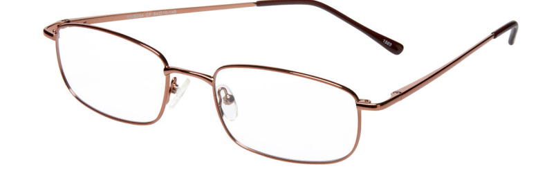
SKU: 1260922 Style: MM 5034 Color: Brown Category: Adult Material: Metal Size: 54 19 145