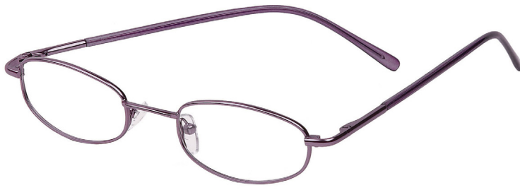
SKU: 10308033 Style: L8009 Color: Plum Category: Kids Material: Metal Size: 46 18 130