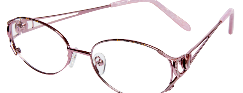
SKU: 1237192 Style: WM2006 Color: Pink Category: Adult Material: Metal Size: 52 16 135