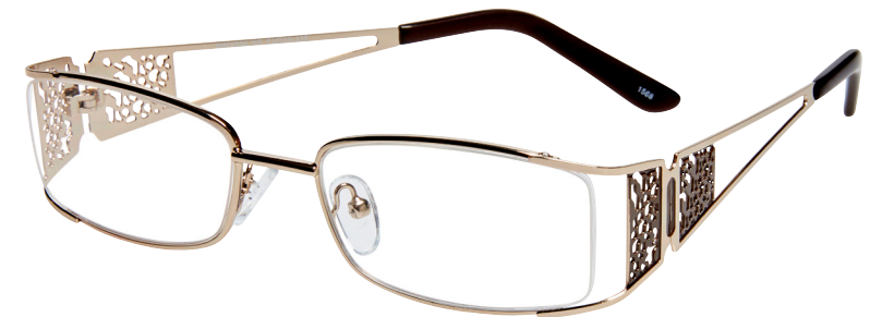
SKU: 1260995 Style: WM1024 GLD Color: Gold Category: Adult Material: Metal Size: 51 18 135