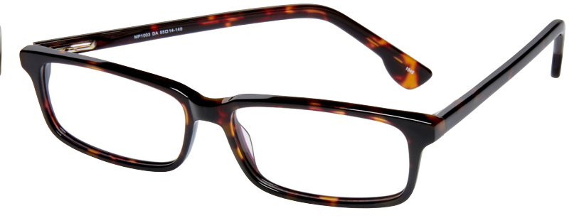
SKU: 1200060 Style: MP1003 DMI Color: Tortoise