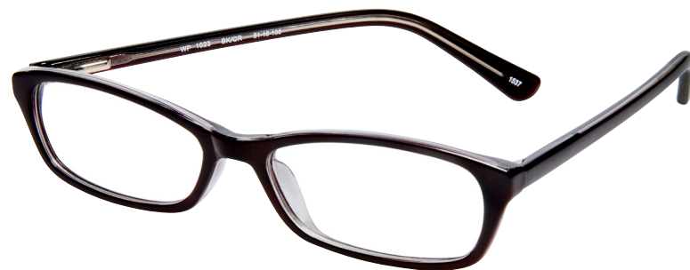
SKU: 1214242 Style: WP1023 BLK Color: Black Category: Adult Material: Plastic Size: 51 15 135