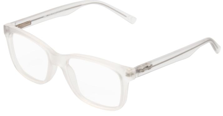
SKU: 10309685 Style: L8041 CRY Color: Crystal Category: Kids Material: Plastic Size: 48 16 135