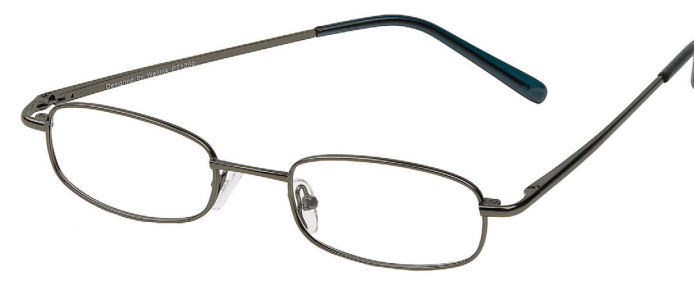
SKU: 10308024 Style: L8008 Color: Gunmetal