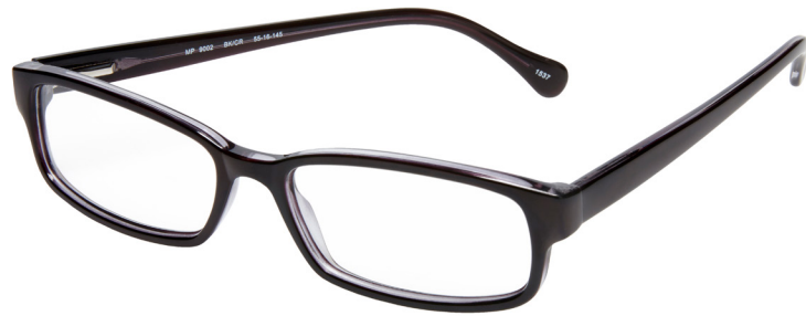
SKU: 1162752 Style: MP9002 BLK Color: Black Category: Adult Material: Plastic Size: 55 16 145