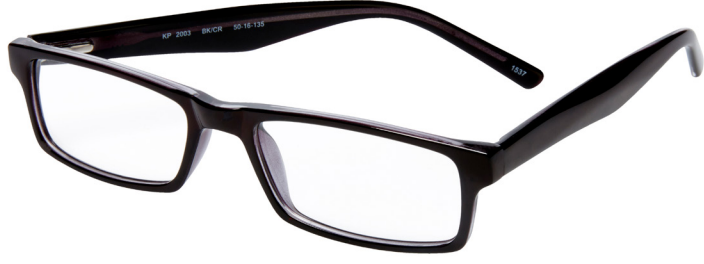
SKU: 1232543 Style: KP2003 BLK Color: Black