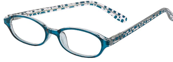
SKU: 10308030 Style: L8015 Color: Teal Category: Kids Material: Plastic Size: 45 16 126