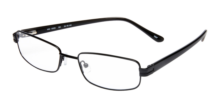
SKU: 1192220 Style: MM0008 BLK Color: Black Category: Adult Material: Metal Size: 54 18 140