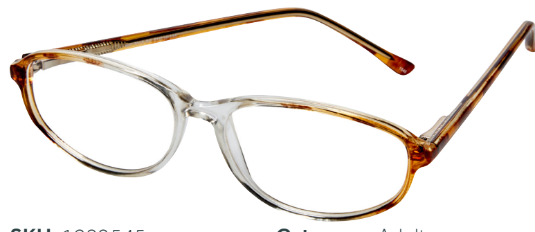
SKU: 1289545 Style: WP7016 BRN Color: Brown Category: Adult Material: Plastic Size: 51 14 135