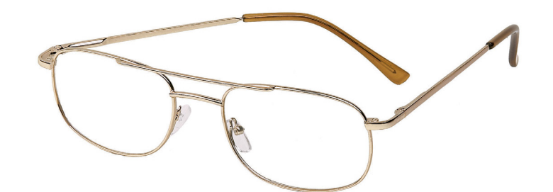
SKU: 10300620 Style: L7010 GLD Color: Gold Category: Adult Material: Metal Size: 54 20 140