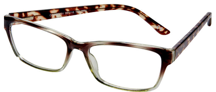
SKU: 1312591 Style: WP6101 GRN Color: Green Category: Adult Material: Plastic Size: 53 16 140