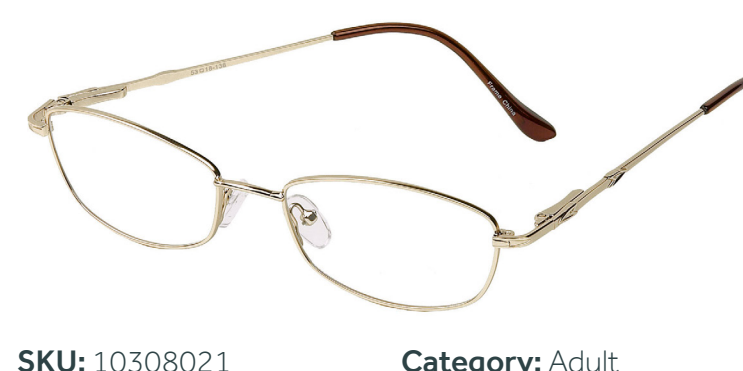
SKU: 10308021 Style: L6007 Color: Gold Category: Adult Material: Metal Size: 53 18 138