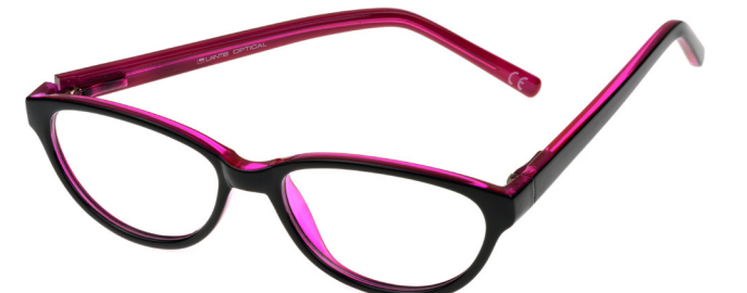
SKU: 10302570 Style: L8026 BLK Color: Black