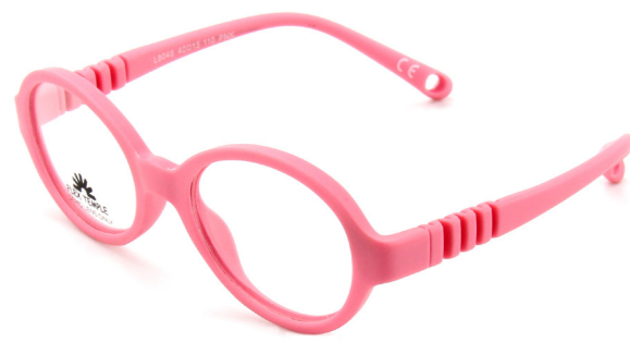
SKU: 10308683 Style: L8048 PNK Color: Pink Category: Kids Material: Plastic Size: 40 15 110