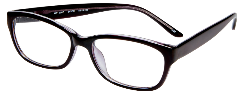
SKU: 1224981 Style: WP2007 BLK Color: Black Category: Adult Material: Plastic Size: 52 15 135