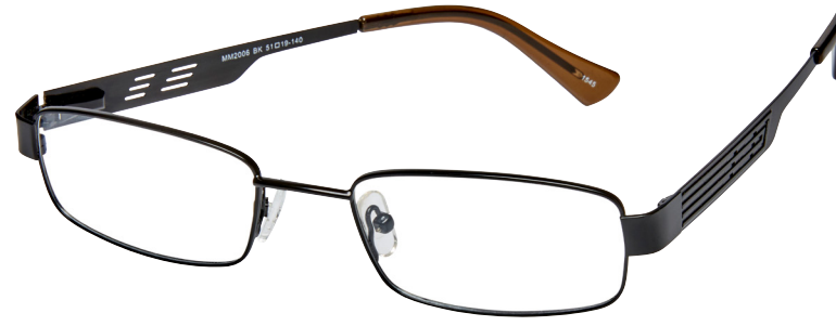
SKU: 1224650 Style: MM2006 BLK Color: Black Category: Adult Material: Metal Size: 51 19 140