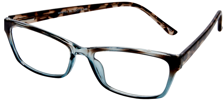
SKU: 1312608 Style: WP6101 BLU Color: Blue Category: Adult Material: Plastic Size: 53 16 140