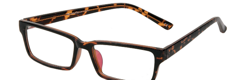
SKU: 10302592 Style: L7006 Color: Tortoise Category: Adult Material: Plastic Size: 57 17 145