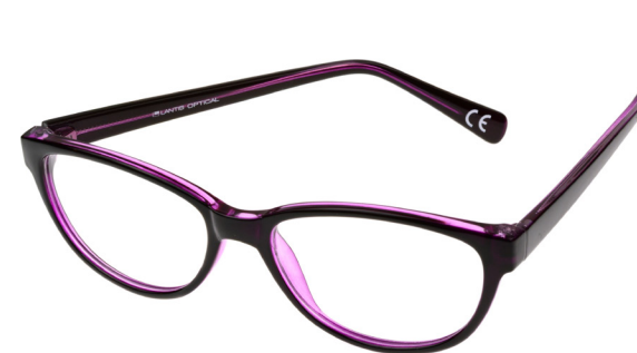
SKU: 10303001 Style: L6017 PRP Color: Purple Category: Adult Material: Plastic Size: 52 16 135