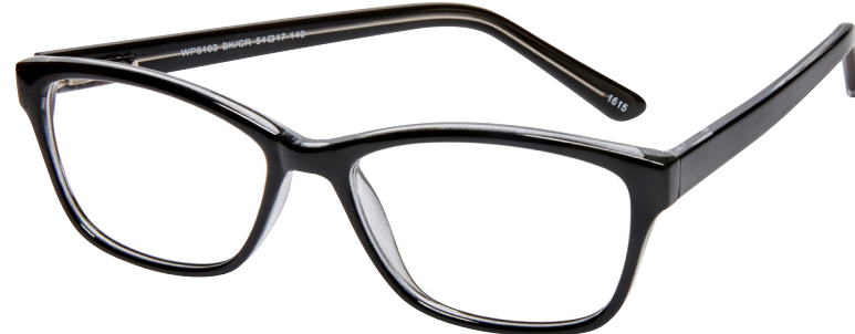
SKU: 1293503 Style: WP5103 BLK Color: Black Category: Adult Material: Plastic Size: 54 17 140