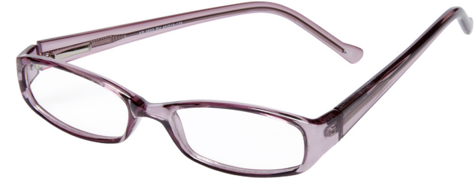
SKU: 1289590 Style: KP0002 PRP Color: Purple