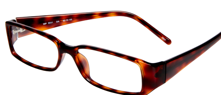
SKU: 1110559 Style: WP5031 DMI Color: Tortoise Category: Adult Material: Plastic Size: 54 15 130