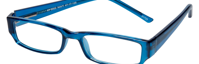
SKU: 1291970 Style: KP5002 NAV Color: Navy