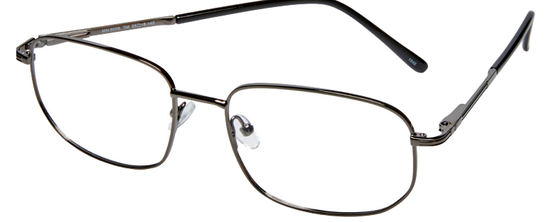
SKU: 1148038 Style: MM8008 GUN Color: Gunmetal Category: Adult Material: Metal Size: 56 18 140