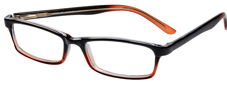
SKU: 1237799 Style: MP2010 BLK Color: Black Category: Adult Material: Plastic Size: 53 17 140