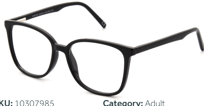
SKU: 10307985 Style: WP5104 BLK Color: Black Category: Adult Material: Plastic Size: 53 17 145