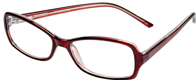
SKU: 1237165 Style: WP2011 BRG Color: Red Category: Adult Material: Plastic Size: 54 16 135