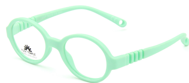
SKU: 10308676 Style: L8047 GRN Color: Green Category: Kids Material: Plastic Size: 38 15 110