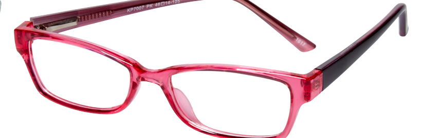
SKU: 1331641 Style: KP7007 PNK Color: Pink