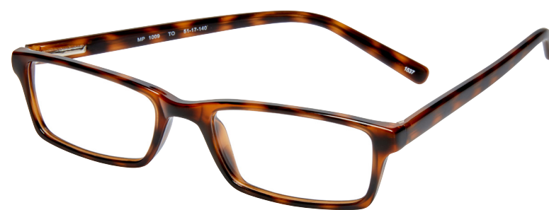
SKU: 1214279 Style: MP1009 TOR Color: Tortoise Category: Adult Material: Plastic Size: 51 17 140