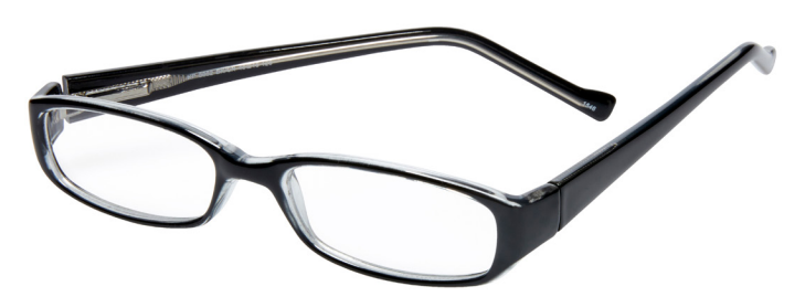
SKU: 1289581 Style: KP0002 BLK Color: Black