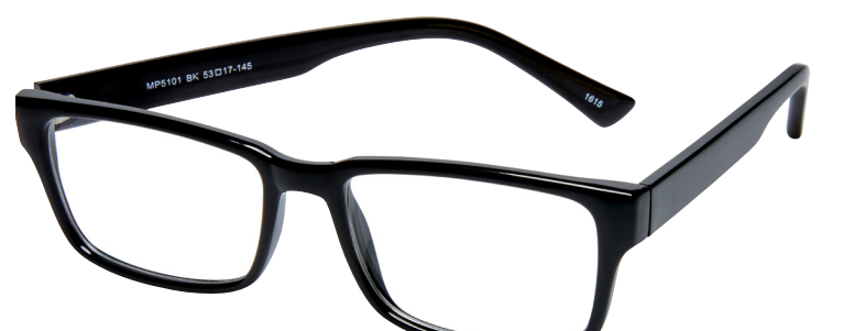
SKU: 1293273 Style: MP5101 BLK Color: Black Category: Adult Material: Plastic Size: 53 17 145