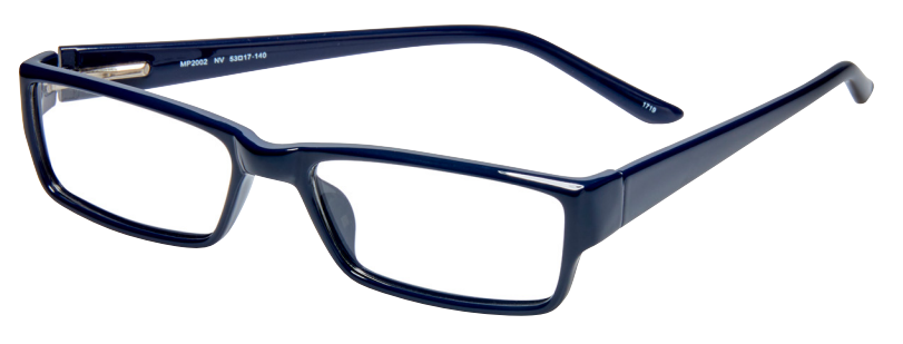
SKU: 1224641 Style: MP2002 NAV Color: Navy Category: Adult Material: Plastic Size: 53 17 140