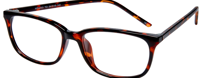
SKU: 1278165 Style: MP4003 TOR Color: Tortoise Category: Adult Material: Plastic Size: 54 16 140