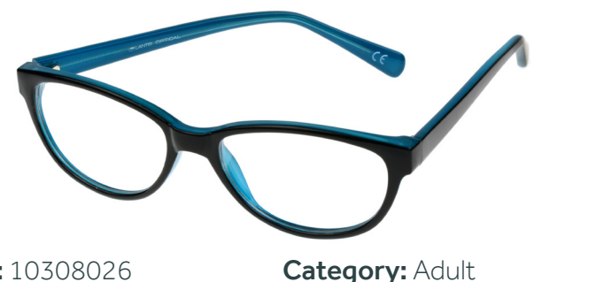
SKU: 10308026 Style: L6017 BLK Color: Black Category: Adult Material: Plastic Size: 52 16 135