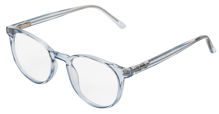
SKU: 10309690 Style: L8054 BLU Color: Blue Category: Kids Material: Plastic Size: 45 17 130