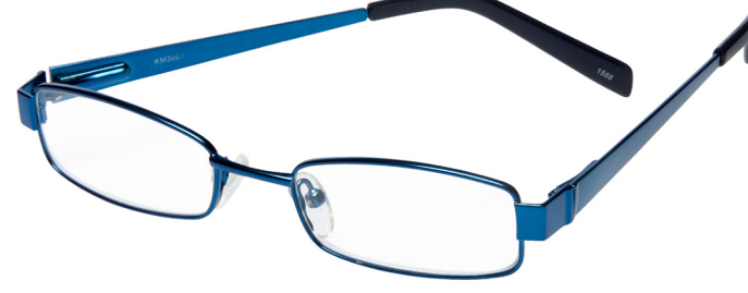
SKU: 1263224 Style: KM3001 BLU Color: Blue