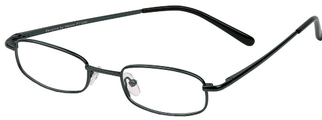
SKU: 10308028 Style: L8008 Color: Blue