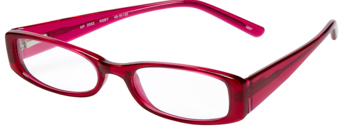
SKU: 1232525 Style: KP2002 RAS Color: Berry