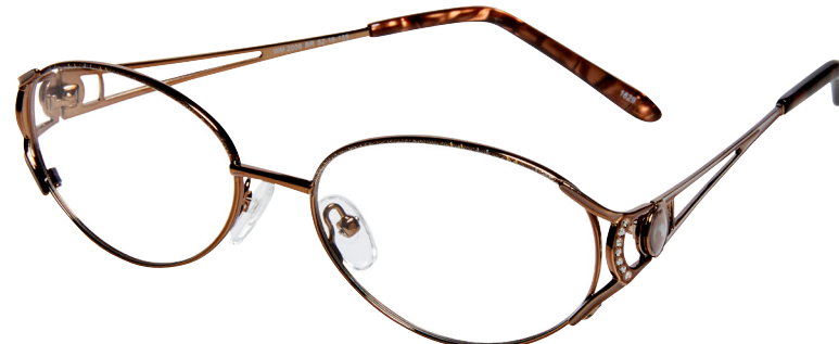
SKU: 1237183 Style: WM2006 BRN Color: Brown Category: Adult Material: Metal Size: 52 16 135