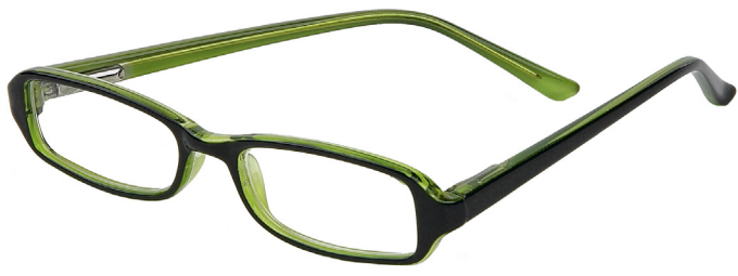
SKU: 10308029 Style: L8016 Color: Black Category: Kids Material: Plastic Size: 45 16 127