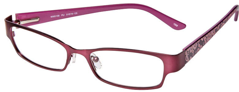
SKU: 1293433 Style: WM5108 PRP Color: Purple Category: Adult Material: Metal Size: 51 16 135