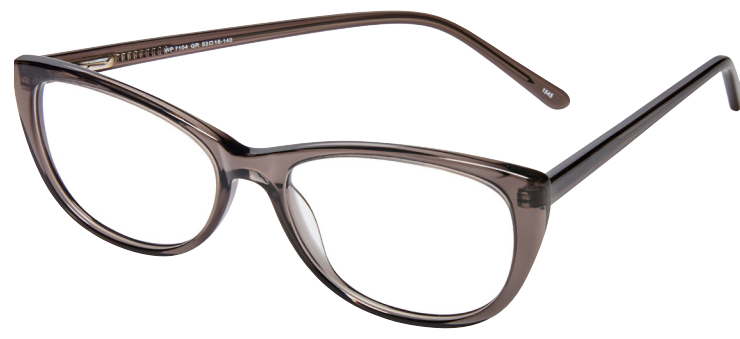
SKU: 1330795 Style: WP7104 GRY Color: Grey Category: Adult Material: Plastic Size: 53 16 140