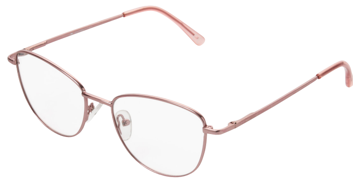
SKU: 10309686 Style: L6032 PNK Color: Pink Category: Adult Material: Metal Size: 52 17 140