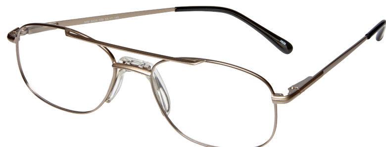
SKU: 1289661 Style: MM5025 GUN Color: Gunmetal Category: Adult Material: Metal Size: 55 17 140