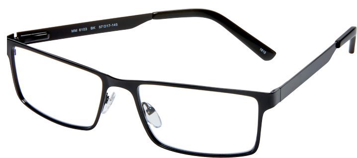
SKU: 1312396 Style: MM6103 BLK Color: Black Category: Adult Material: Metal Size: 57 17 145