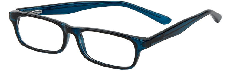
SKU: 10308420 Style: L8020 NAVY Color: Navy Category: Kids Material: Plastic Size: 48 14 128