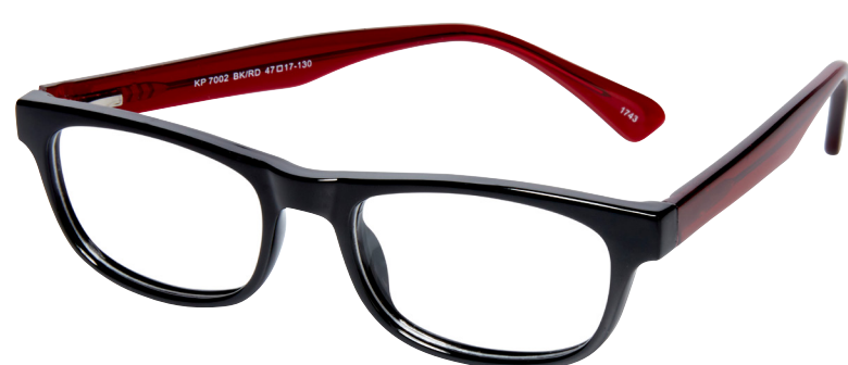
SKU: 1331981 Style: KP7002 BLR Color: Black Category: Kids Material: Plastic Size: 47 17 130