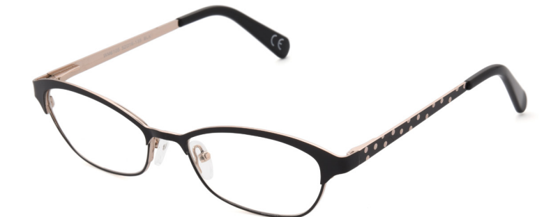
SKU: 1312564 Style: WM6105 BLK Color: Black Category: Adult Material: Metal Size: 52 16 135