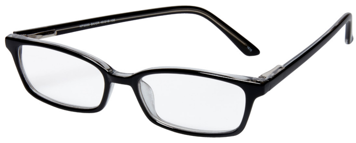
SKU: 1264116 Style: KP3000 BLK Color: Black