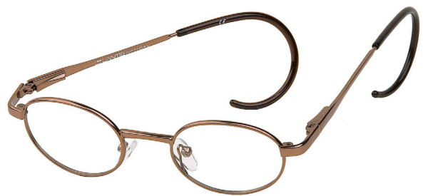
SKU: 10308417 Style: L8005 Color: Brown