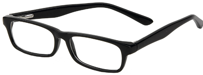
SKU: 10308421 Style: L8020 BLK Color: Black Category: Kids Material: Plastic Size: 46 16 135