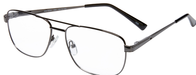
SKU: 1293200 Style: MM5104 GUN Color: Gunmetal Category: Adult Material: Metal Size: 55 15 140