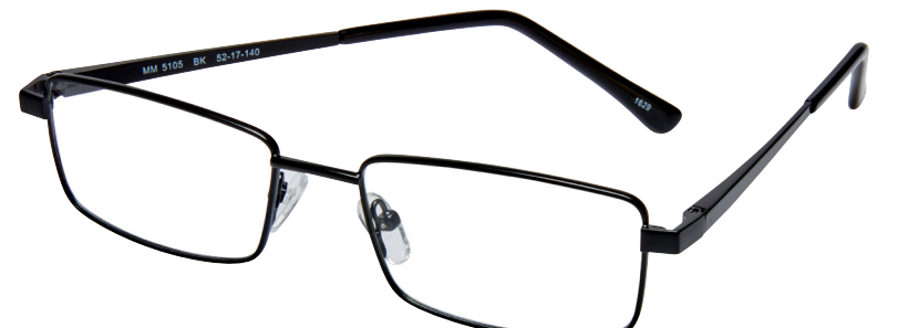
SKU: 1293219 Style: MM5105 BLK Color: Black Category: Adult Material: Metal Size: 52 17 140