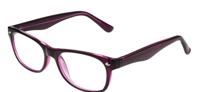
SKU: 10303215 Style: L6018 LAV Color: Lilac Category: Adult Material: Plastic Size: 52 17 145