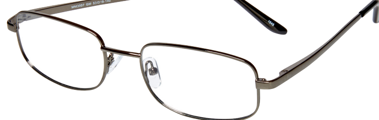
SKU: 1265614 Style: MM3007 GUN Color: Gunmetal Category: Adult Material: Metal Size: 53 19 140