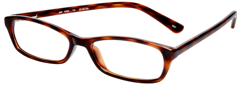
SKU: 1214233 Style: WP1023 Color: Tortoise Category: Adult Material: Plastic Size: 51 15 135