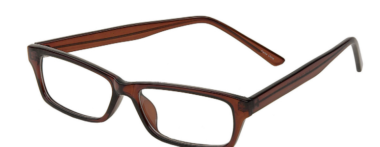
SKU: 10302595 Style: L7007 BRN Color: Brown Category: Adult Material: Plastic Size: 55 17 145