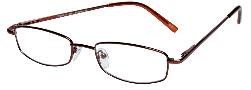
SKU: 1202059 Style: WM1017 BRN Color: Brown Category: Adult Material: Metal Size: 50 18 135