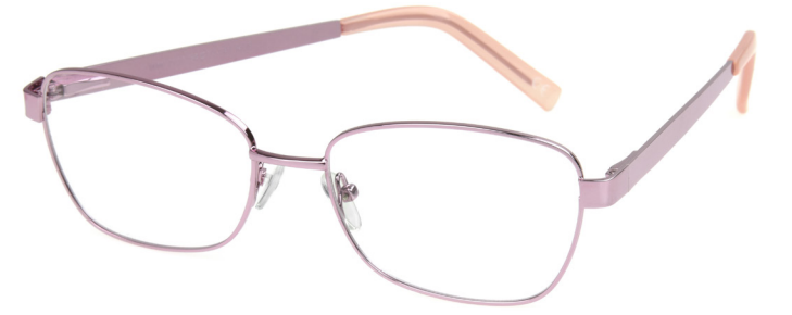
SKU: 1330946 Style: WM7100 ROS Color: Pink Category: Adult Material: Metal Size: 54 17 140