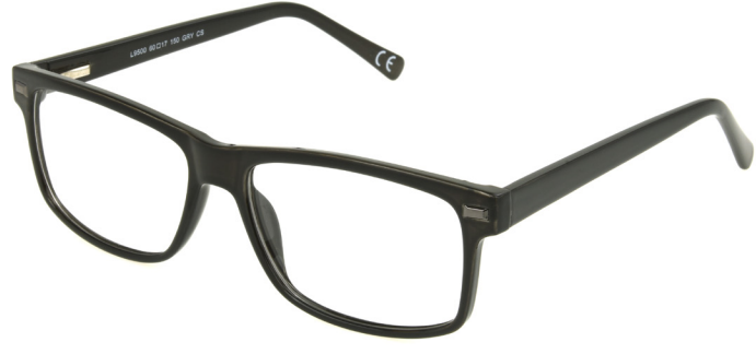
SKU: 10308674 Style: L9500 GRY Color: Grey Category: Adult Material: Plastic Size: 60 17 150