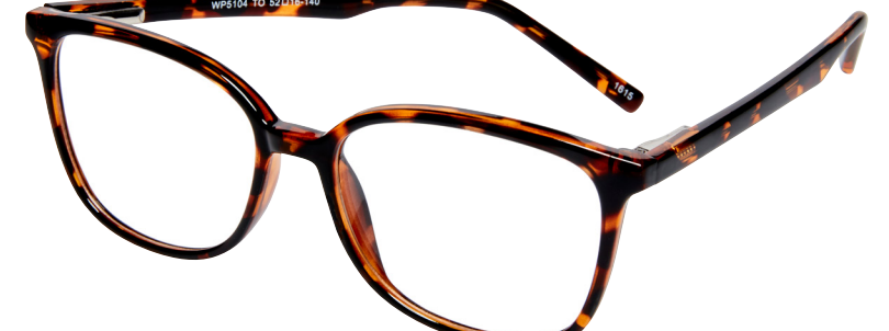
SKU: 1293512 Style: WP5104 TOR Color: Tortoise Category: Adult Material: Plastic Size: 52 16 140