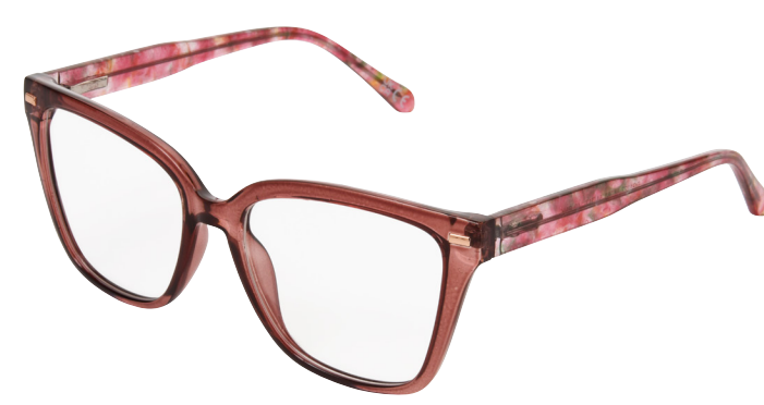
SKU: 10309687 Style: L6080 PNK Color: Pink Category: Adult Material: Plastic Size: 54 17 140