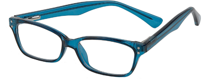
SKU: 10308032 Style: L8019 NAV Color: Navy Category: Kids Material: Plastic Size: 45 13 128