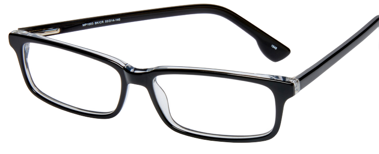
SKU: 1200051 Style: MP1003 BLK Color: Black