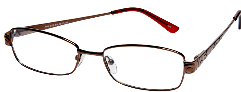
SKU: 1264376 Style: WM3002 BRN Color: Brown Category: Adult Material: Metal Size: 53 17 135