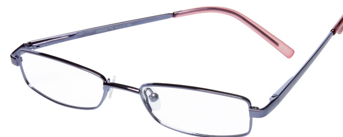
SKU: 1169087 Style: KM 0005 PRP Color: Purple Category: Kids Material: Metal Size: 48 17 135