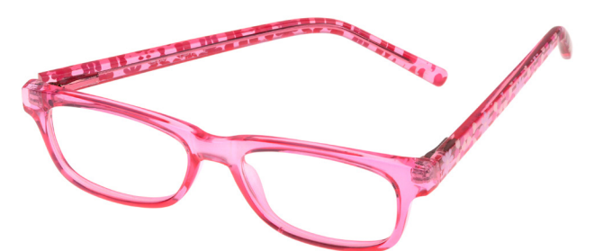
SKU: 10308426 Style: L8027 ROS Color: Pink Category: Kids Material: Plastic Size: 46 15 130