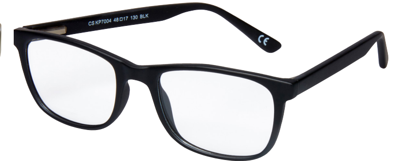
SKU: 1331632 Style: KP7004 BLK Color: Black