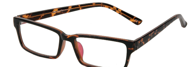
SKU: 10300648 Style: L7006 Color: Tortoise Category: Adult Material: Plastic Size: 55 17 140