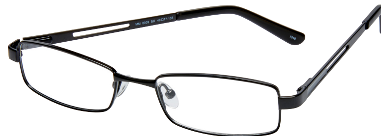
SKU: 1148092 Style: MM8009 BLK Color: Black Category: Adult Material: Metal Size: 49 17 135