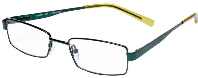
SKU: 1275569 Style: KM4001 GRN Color: Green