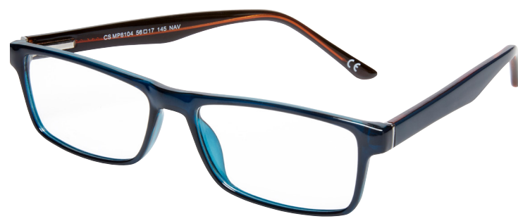
SKU: 1338902 Style: MP8104 NAV Color: Navy Category: Adult Material: Plastic Size: 56 17 145