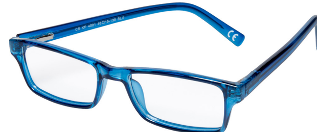
SKU: 1275667 Style: KP4001 BLU Color: Blue