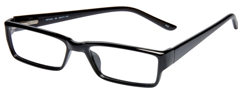
SKU: 1224632 Style: MP2002 BLK Color: Black Category: Adult Material: Plastic Size: 53 17 140