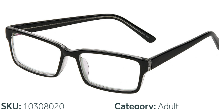
SKU: 10308020 Style: L7006 Color: Black Category: Adult Material: Plastic Size: 55 17 140