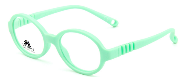
SKU: 10308682 Style: L8048 GRN Color: Green Category: Kids Material: Plastic Size: 40 15 110