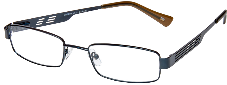
SKU: 1224669 Style: MM2006 NAV Color: Navy Category: Adult Material: Metal Size: 51 19 140