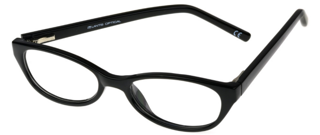
SKU: 10303008 Style: L8028 BLK Color: Black Category: Kids Material: Plastic Size: 48 17 130