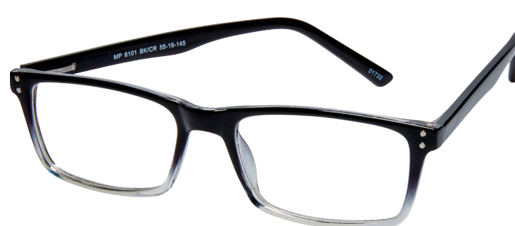
SKU: 1312822 Style: MP6101 BLK Color: Black Category: Adult Material: Plastic Size: 55 18 145