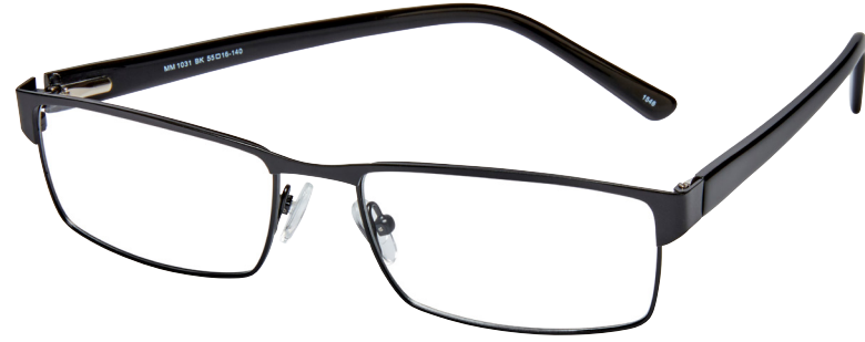
SKU: 1214297 Style: MM1031 GUN Color: Gunmetal Category: Adult Material: Metal Size: 55 16 140