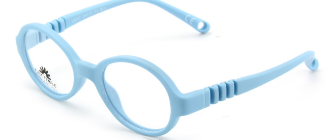
SKU: 10308677 Style: L8047 BLU Color: Blue