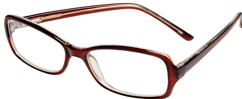
SKU: 1237174 Style: WP2011 BRN Color: Brown Category: Adult Material: Plastic Size: 54 16 135