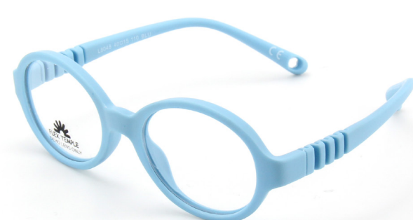
SKU: 10308681 Style: L8048 BLU Color: Blue