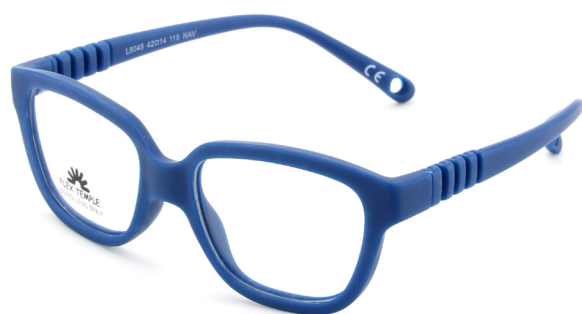
SKU: 10308680 Style: L8049 NAV Color: Navy