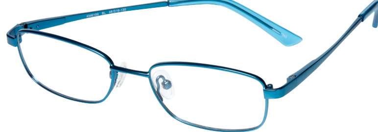
SKU: 1312163 Style: KM6100 BLU Color: Blue