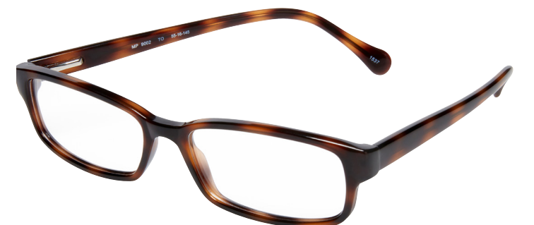
SKU: 1162743 Style: MP9002 TOR Color: Tortoise Category: Adult Material: Plastic Size: 55 16 145