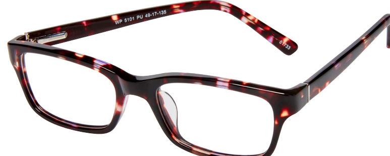
SKU: 1293665 Style: WP5101 PRP Color: Purple Category: Adult Material: Plastic Size: 49 17 135