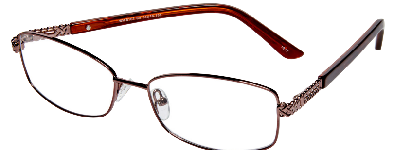
SKU: 1312537 Style: WM6104 BRN Color: Brown Category: Adult Material: Metal Size: 54 16 135