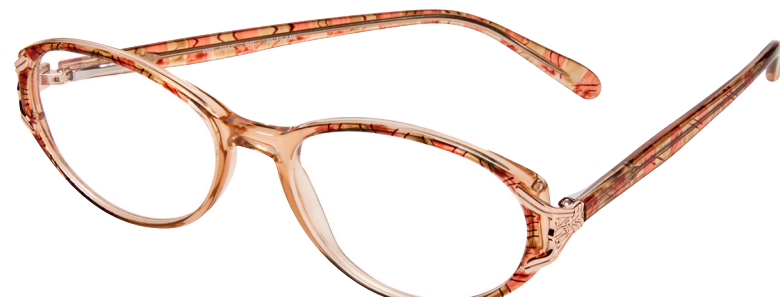
SKU: 1261627 Style: WP7012 BRN Color: Brown Category: Adult Material: Plastic Size: 55 19 140