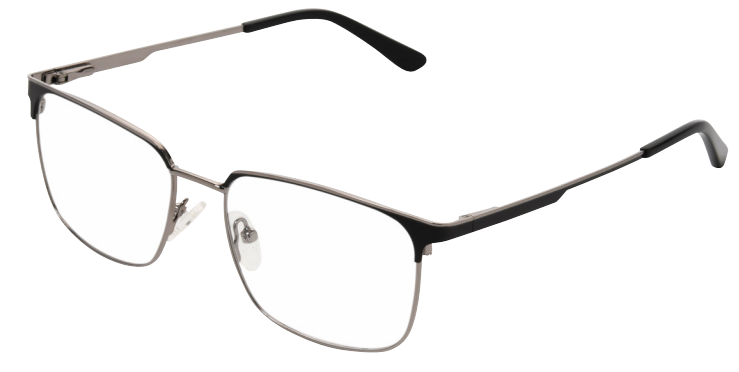
SKU: 10309692 Style: L7088 BLK Color: Black Category: Adult Material: Metal Size: 54 17 140