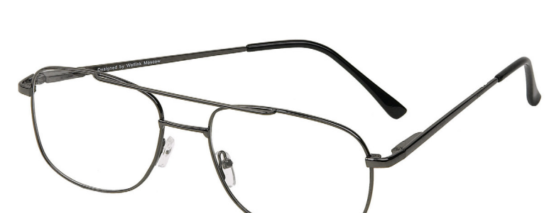
SKU: 10308019 Style: L7009 Color: Gunmetal Category: Adult Material: Metal Size: 58 19 150