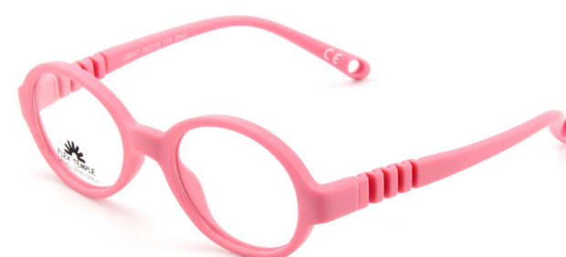
SKU: 10308678 Style: L8047 PNK Color: Pink Category: Kids Material: Plastic Size: 38 15 110