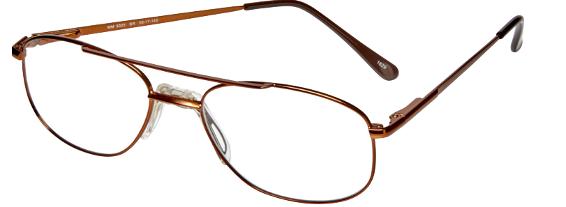
SKU: 1289652 Style: MM5025 BRN Color: Brown Category: Adult Material: Metal Size: 55 17 140